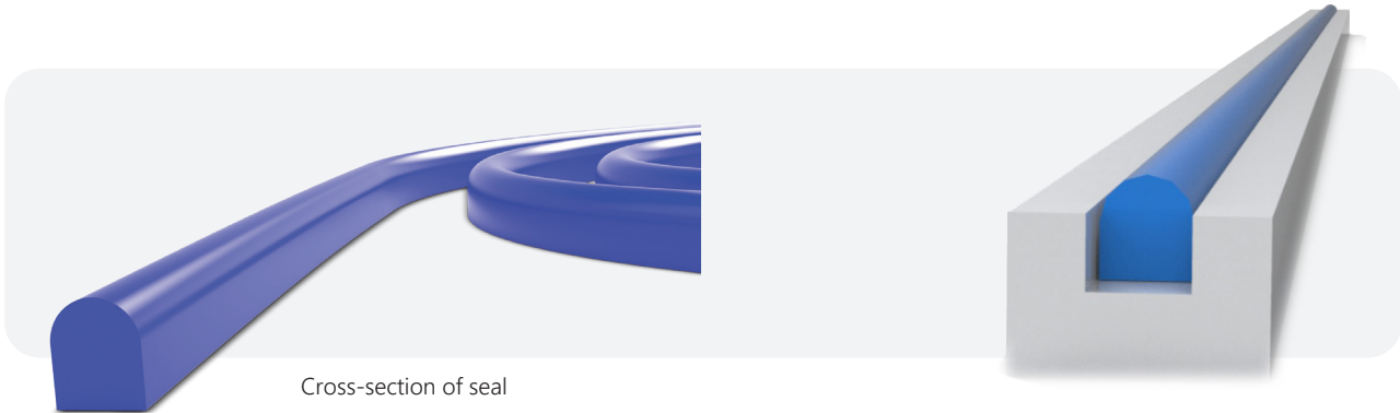
Cross-section of seal