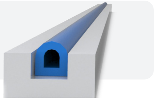
Recommended groove dimensions Machining tolerance: \pm 0,05